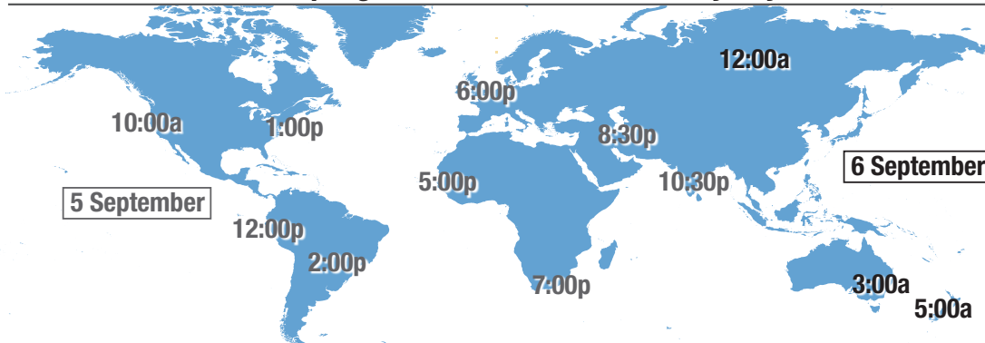
A sampling of worldwide times for Unity Day

Participate however you are able—attend a Unity Day event or meeting, gather with friends in person or virtually, or take a moment to yourself at any time on Unity Day to celebrate our worldwide NA Fellowship.