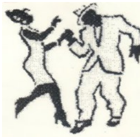
Reach Out & I'll Be There.

The fourth Friday of the month @ Mount Vernon Community Center 2622 W. Jackson Blvd. Chicago IL The dance starts @ 9:00pm. Cost is $5.00 @ door. Come out and Fellow- ship, dance, play cards and have some clean fun!!!