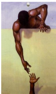
Reach Out & I'll Be There.

Today our notion of fun has changed. Fun to us today is a walk along the ocean ,watching the dolphins frolic as the sun sets behind them. Fun is going to an NA picnic, or attending the comedy show at the NA convention. Fun is getting dressed up to go to the banquet and not worrying about any gun battles breaking out over who did what to whom. Through the grace of a Higher Power and the Fellowship of Narcotics Anonymous, our ideas of fun have changed radically. Today when we are up to see the sun rise, it's usually because we went to bed early the night before, not because we left the club at six in the morning, eyes bleary from a night of drug use. And if that's all we received from Narcotics Anonymous that would be enough. Just for today: I will have fun in my recovery!