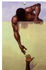
Reach Out & I'll Be There.