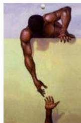
Reach Out & I'll Be There.